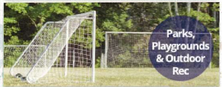
Parks, Playgrounds & Outdoor Rec