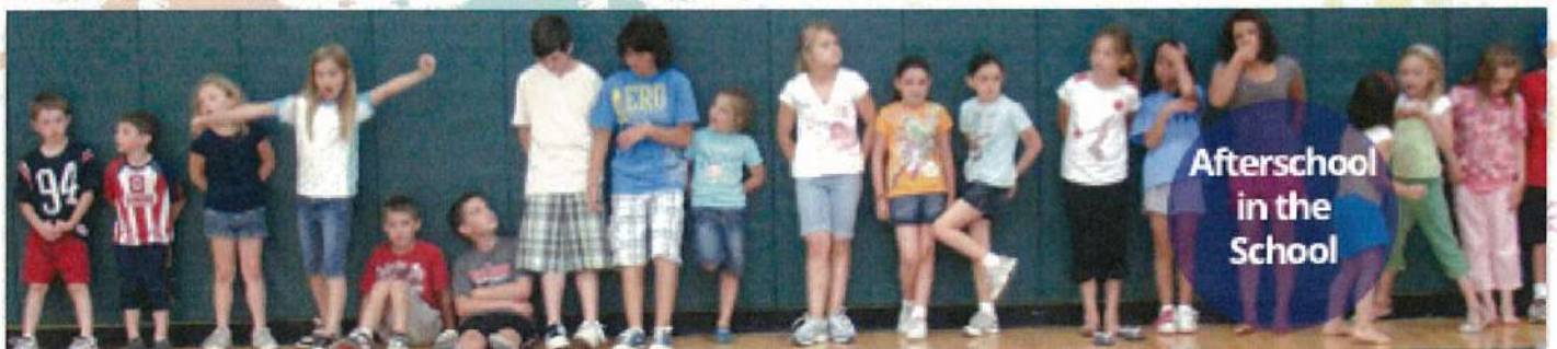
Afterschool in the School