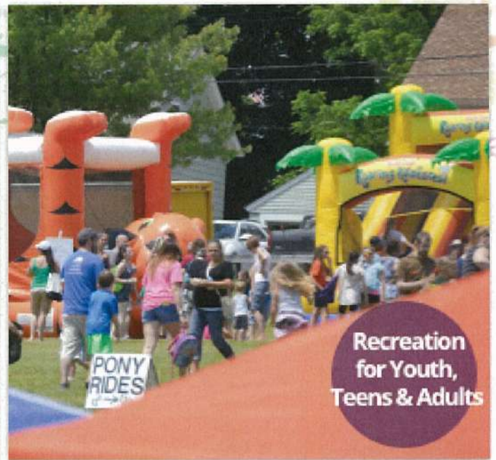
Recreation for Youth, Teens & Adults