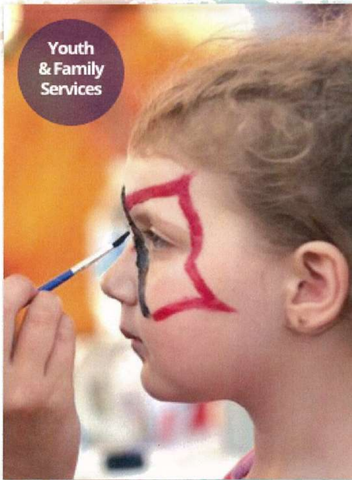
Youth & Family Services