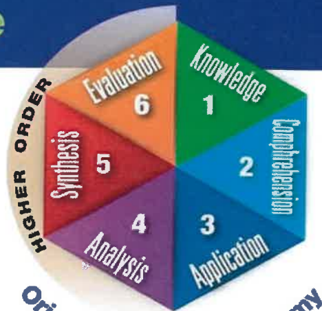
Original Bloom's Taxonomy