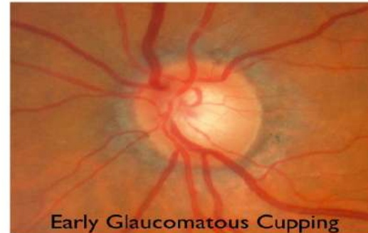
Early Glaucomatous Cupping