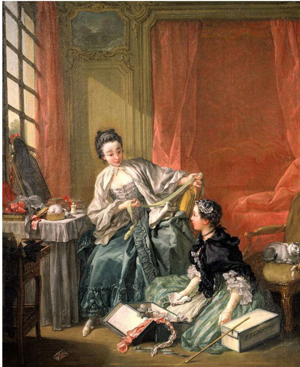
The Fashion Merchant Photos 12.com — ARJ Chapter 19, A History of Western Society , Tenth Edition Copyright © 2011 by Bedford/St. Martin's Page 602