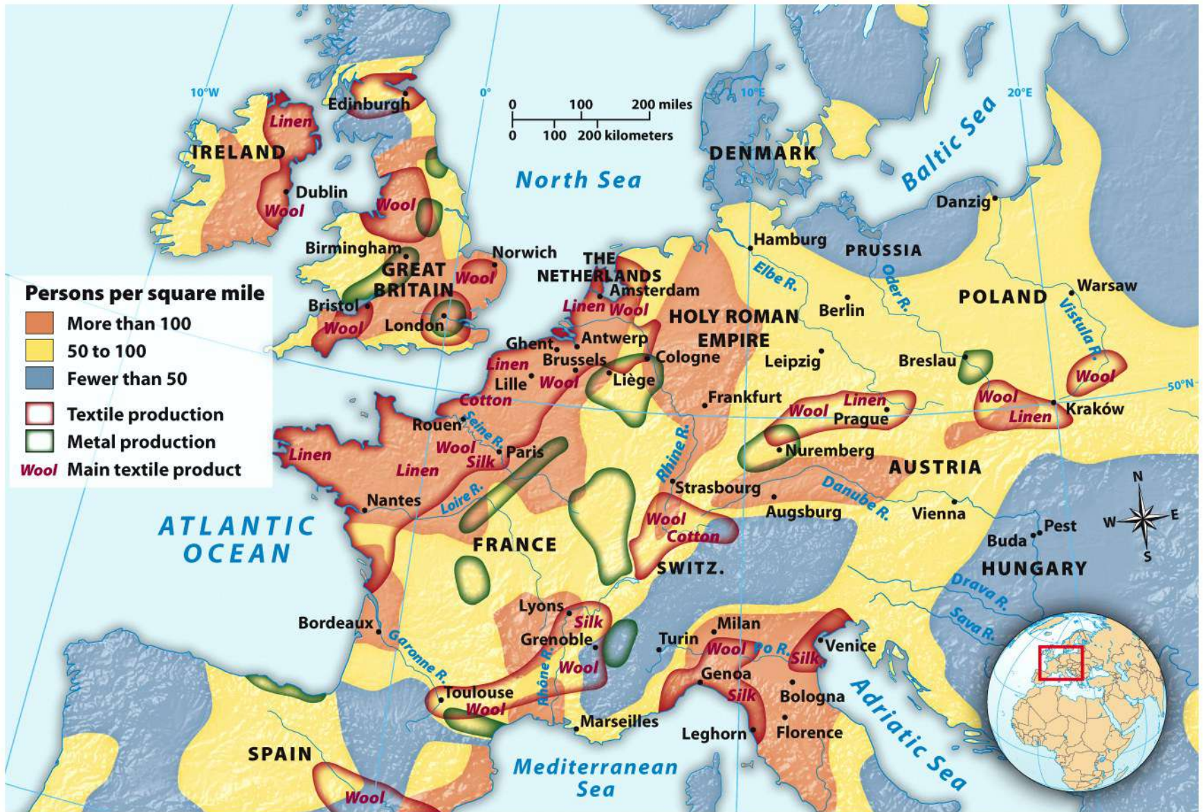
Map 18.1 Industry and Population in Eighteenth-Century Europe Chapter 18, A History of Western Society , Tenth Edition Copyright © 2011 by Bedford/St. Martin's Page 562