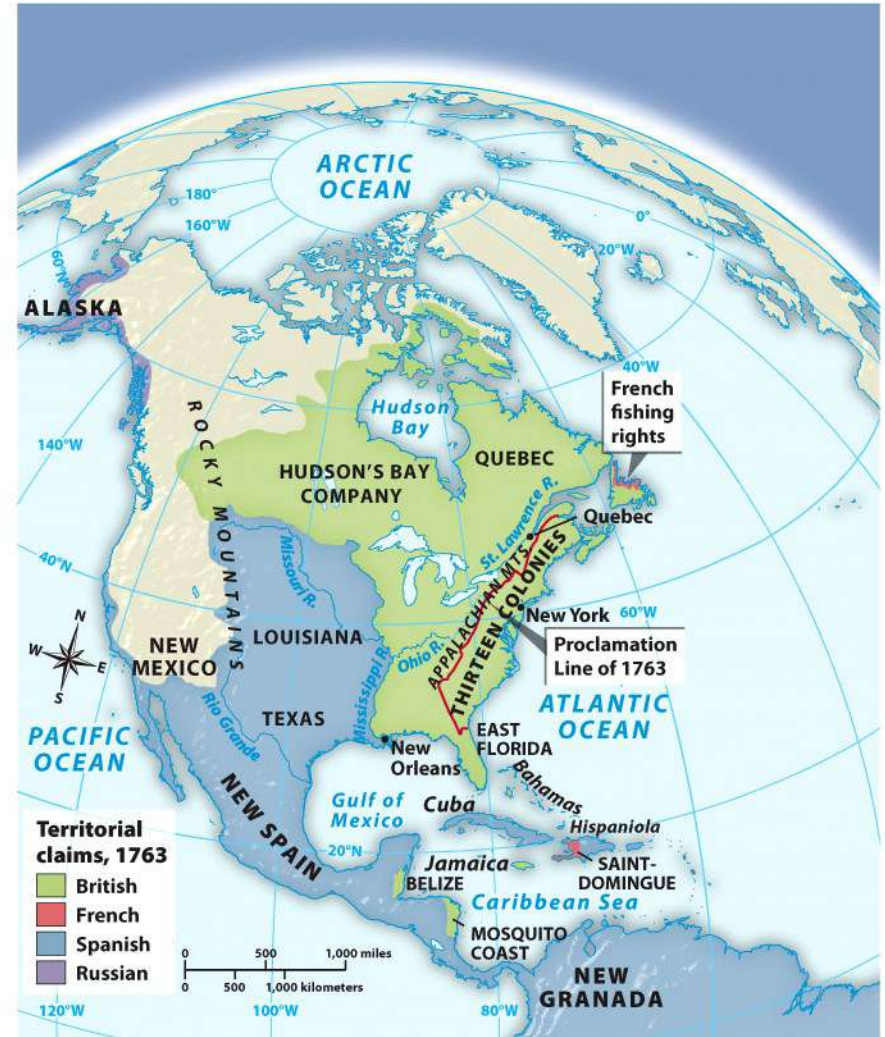
Map 18.3 European Claims in North America Before and After the Seven Years' War, 1755-1763

Chapter 18, A History of Western Society , Tenth Edition