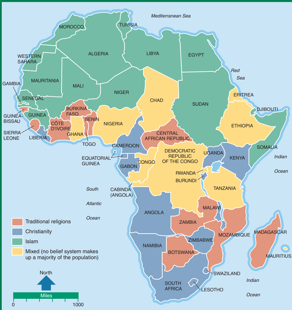
Distribution of belief systems in Africa, by country

Many African dictators, such as Isaias Afwerki in Eritrea, have persecuted Muslims as well as Christians, especially when they refused to do what the government demanded. Much of Africa's religious and ethnic conflict is the aftereffect of the colonial period, when European powers seized control of most of the continent and its resources. You'll read about that in the next lesson.