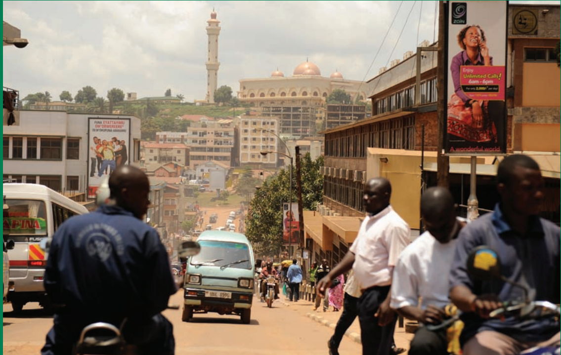
A mosque sits on a hill above busy Kampala, Uganda.

Today the number of those practicing Islam across Africa is only slightly smaller than the number of Christians.