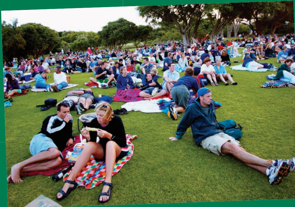
White South Africans picnic at a concert at Cape Town's Kirstenbosch National Botanical Gardens.