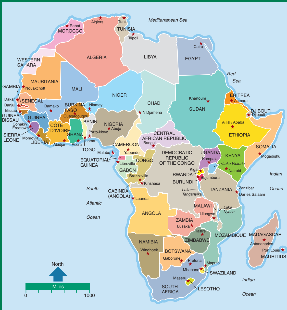
A political map of Africa