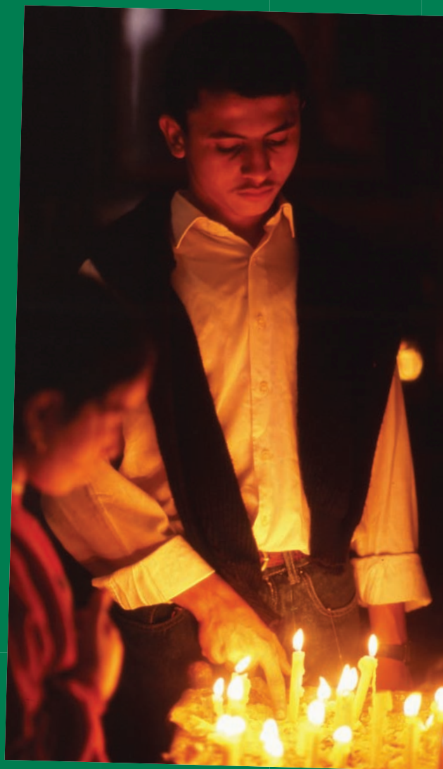
Worshippers light candles at a Coptic Christian Church in Cairo, Egypt’s, Old City.

In Nigeria, conflicts between Christians and Muslims in the country’s northern states have grown as Islamic fundamentalists and Wahhabists have pushed to implement Islamic law. They have tried to apply it to Christians and other non-Muslims as well as to Muslims. Nigeria’s many ethnic divisions often make the conflict worse.