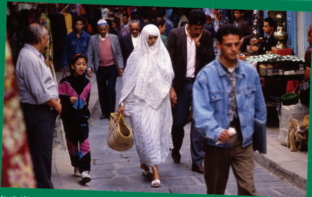
North Africans in their traditional attire mix with tourists in Tunisia, Tunisia.

Arabs speak Arabic. Berbers have their own Berber language, spoken by 14 million to 25 million people. Both groups are predominantly Muslim. Two of the most famous Berbers were not, however: the Roman Emperor Severus Septimus and St. Augustine, Christian Bishop of Hippo (354–430).