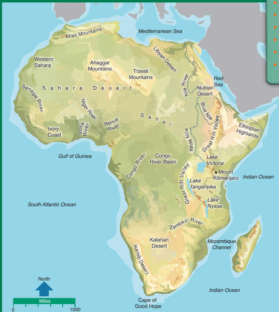
A topographical map of Africa