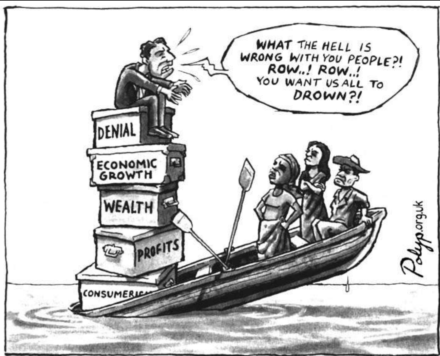
'THE SAME BOAT'