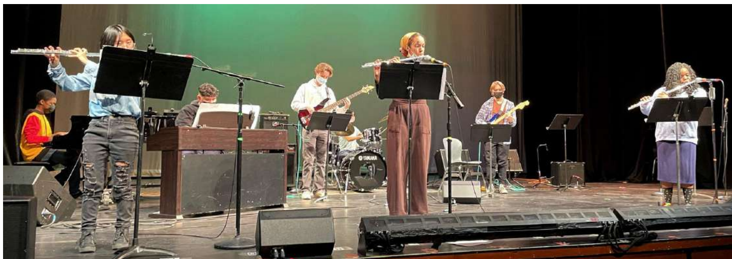
RCA students rehearse on the main stage for an upcoming show.