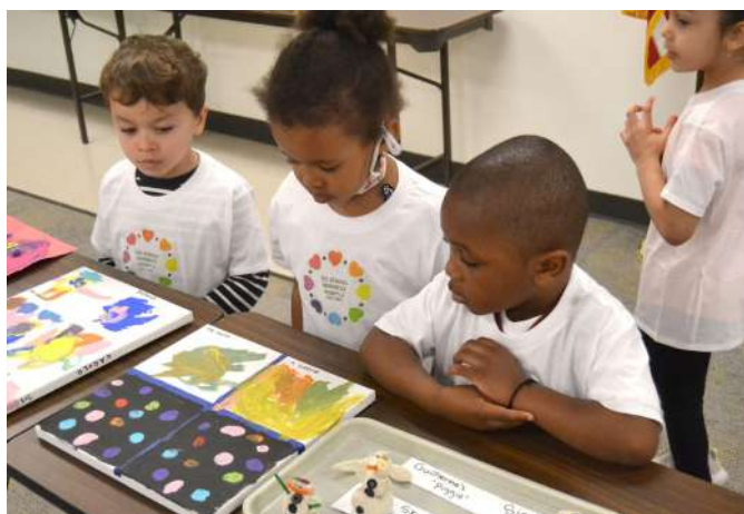
School Readiness students look at classmates' artwork.

We are actively looking for opportunities for our students to work in professional settings, including theaters, concert halls and recording studios. Partnering with local businesses in the performing arts will allow our students to form meaningful connections and increase the school's visibility in the community. The highly successful Principal's Advisory Committee will be expanded this year.