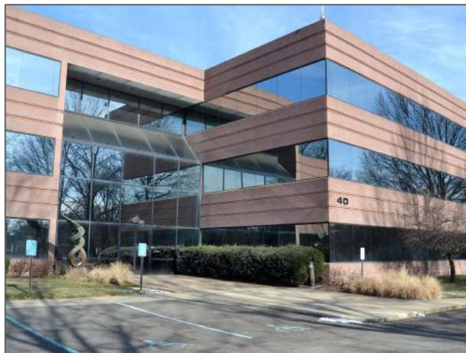
The new CES property at 40 Oakview Drive, Trumbull.

As a service center, we must always be prepared to assist our districts according to their individual needs. We compile an annual profile of our member districts that includes their goals, school data reports, comprehensive school improvement plans, and additional relevant information to further customize our services. Often state or federal mandates or economic conditions determine needs. We strive to provide lower-cost, high-quality options to satisfy the needs of our member districts.