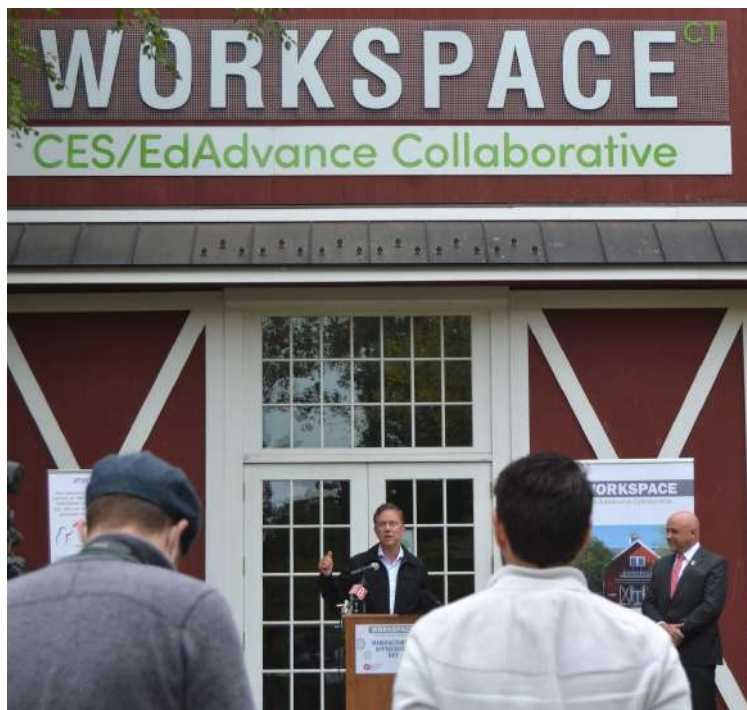
Connecticut Gov. Ned Lamont visited WorkspaceCT as part of the state’s Manufacturing Month in October 2021.

Learn more about the facility and opportunities there at www.workspacect.org .