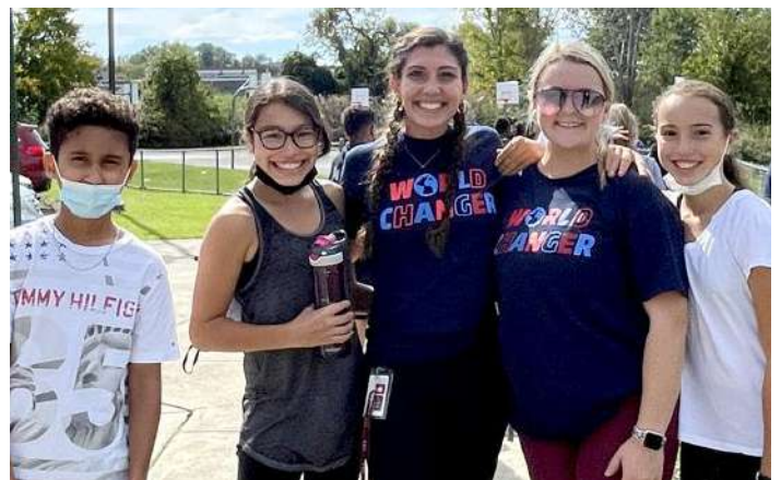
Students and staff at Six to Six.

Six to Six understands that the social curriculum is as important as the academic curriculum. Therefore, we incorporate strategies in our classrooms that bring