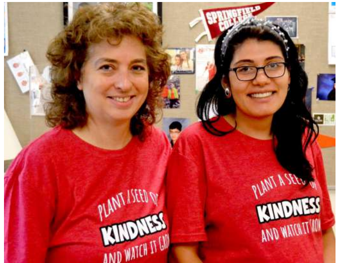
Special Education staffers are committed to kindness.

Therapeutic Day Program (TDP) is for students from grades K-12 who present with a variety of significant behavioral and emotional disabilities. TDP offers a comprehensive treatment