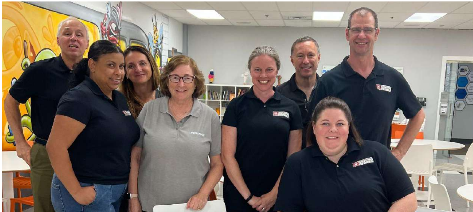
Members of the CES Leadership team during a retreat at WorkspaceCT in Bethel.