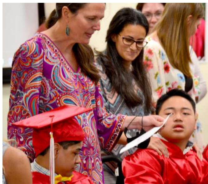
Special Education graduation ceremonies are held each June for students moving up to new programs.

Six to Six will continue to align and refine curriculum with a priority focus on high-quality interventions including enhanced social, emotional, and behavioral supports given students' post-pandemic needs.