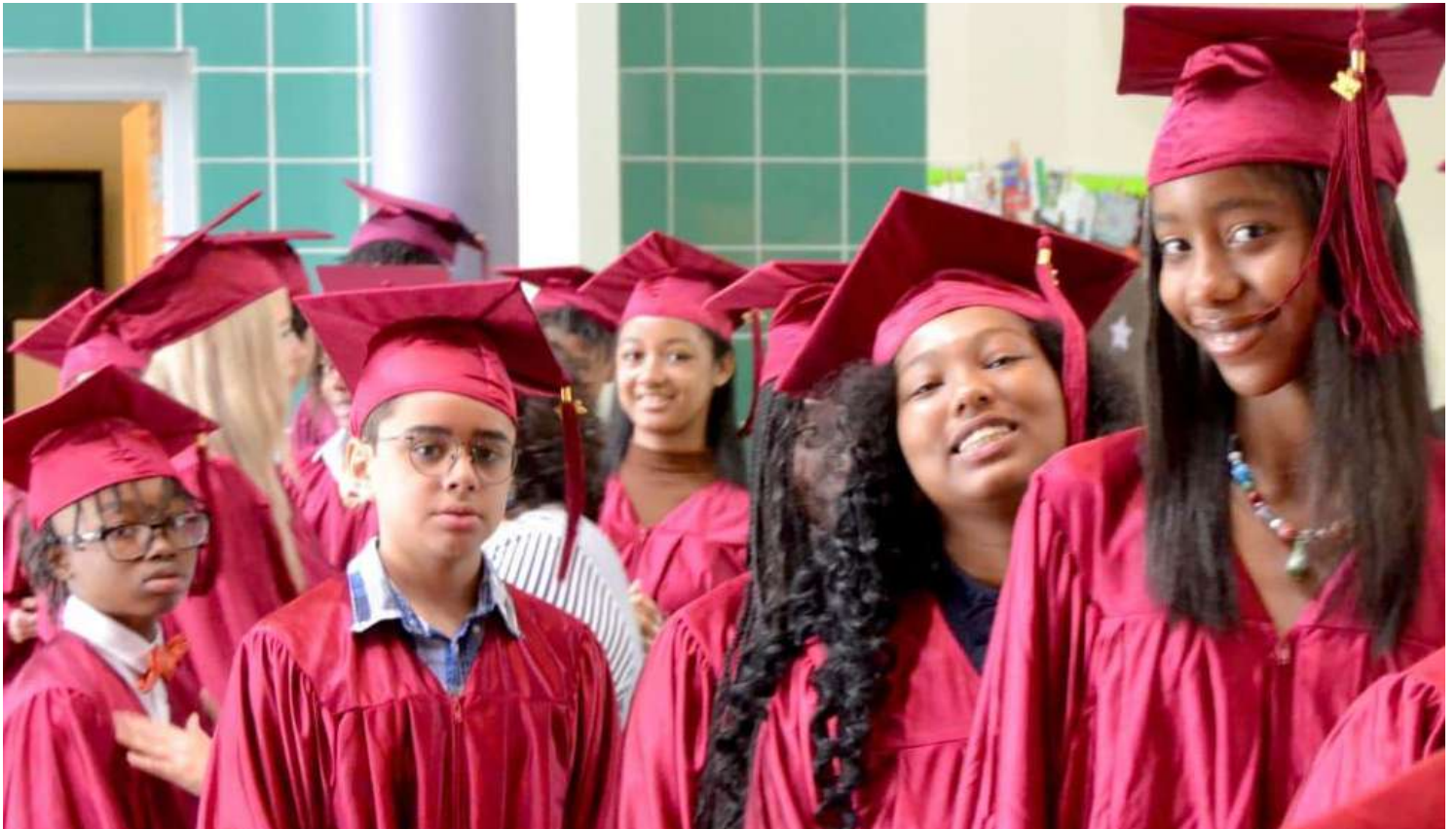
The 2022 graduates wait for ceremonies to begin.