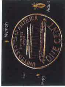
Lice at various stages of their life cycle

Treatment: The Iowa Department of Public Health recommends a 14-day treatment process. You may use over-the-counter products. They are safe and not costly. Mark your calendar to help you keep track of treatment.