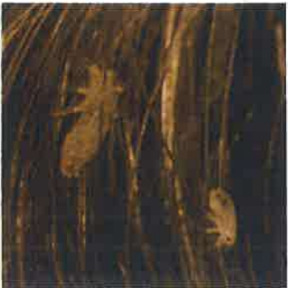
Image of real lice