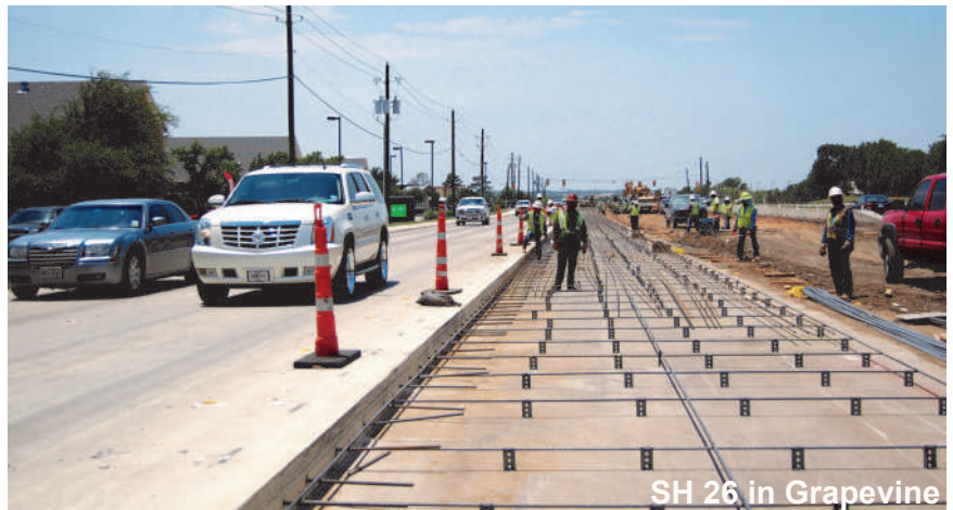
SH 26 in Grapevine