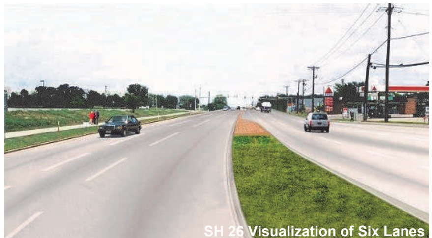
SH 26 Visualization of Six Lanes