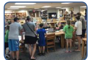
Chromebooks are distributed to WMS students to begin the school year.