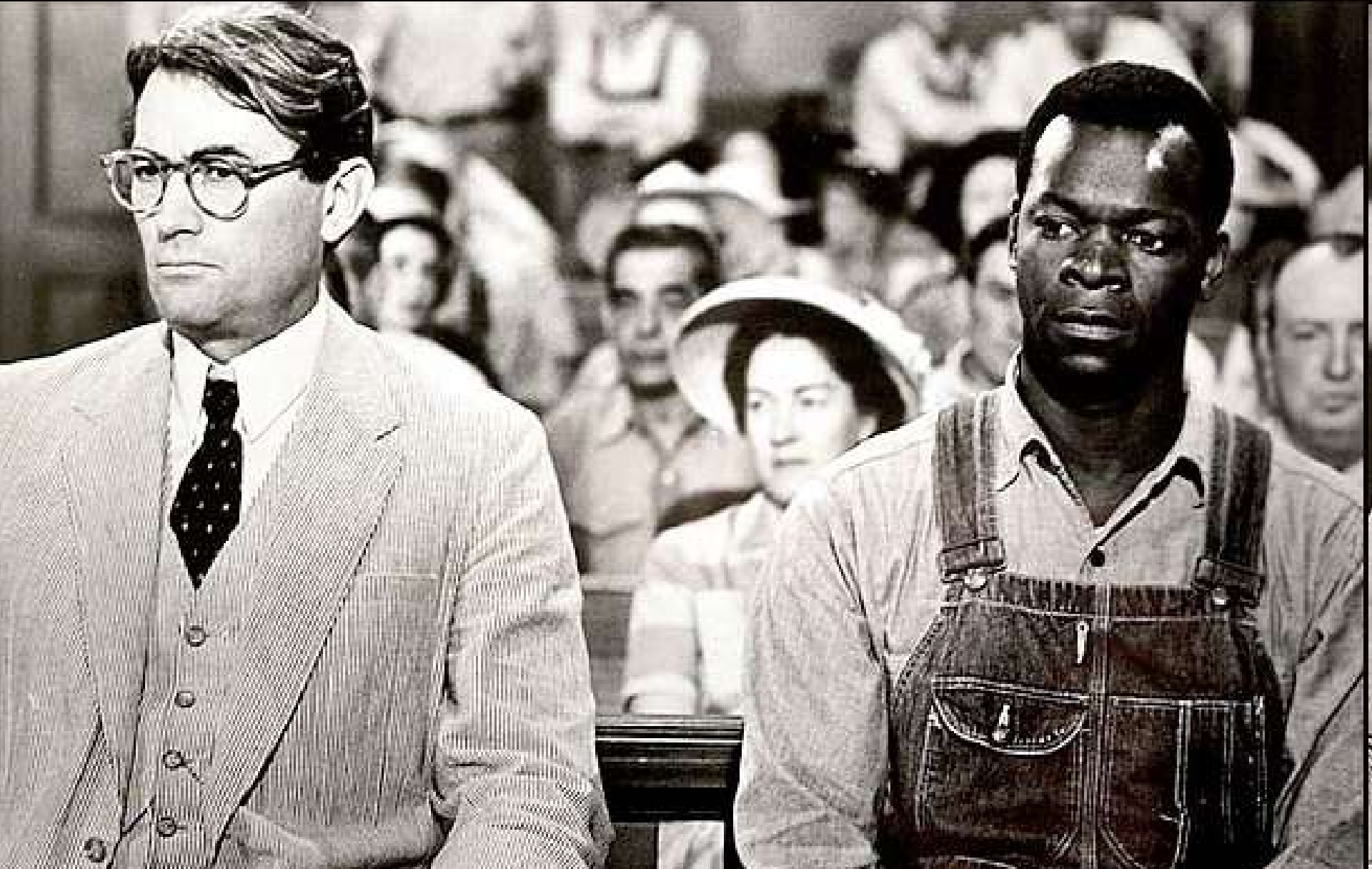
Atticus Finch, Father, Lawyer, and Honorable Man