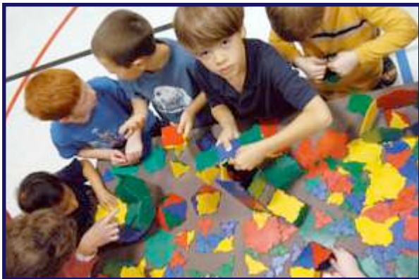
Young children develop understanding through manipulatives.

Kindergarten students developed number sense in a variety of ways. They played math games, used manipulatives , such as connecting cubes and links to represent different quantities, and solved daily story problems. Kindergarten teachers incorporated literature, music, and art into their math lessons, giving students a chance to experience math in many different forms.