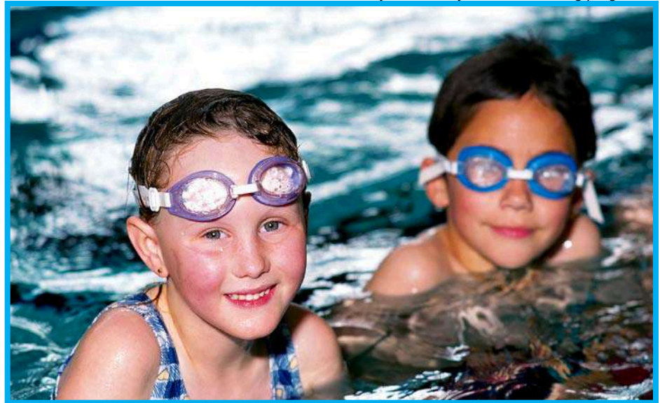
The state's only elementary school swimming program...

3. The newly renovated tennis courts are used to expose our students in