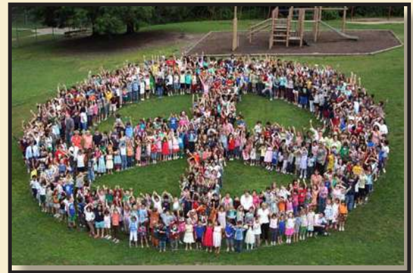
BRS students and staff form Peace Sign during ArtsWeek, June 2010.

Here is a summary of the budget with clarifications for each category. The Woodbridge Board of Education seeks to make the budget process transparent and help taxpayers understand what they are being asked to pay for.*