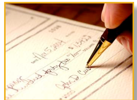
Sixth graders learn real-life math from a banker.

A representative from TD Bank visited all the sixth grade classes, speaking to students about checking and savings accounts and demonstrating how to fill out a check register. The follow-up questions from the sixth graders were probing and detailed; from this experience they were able to see a real world application of math skills and concepts.