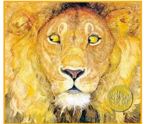
The Lion and the Mouse , by Jerry Pinkney

In addition, the Library Media Center developed a special Intermediate classroom library collection. This collection supports a non-fiction unit that includes a variety of titles that appeal to the special interests of students. The Library Media Center and Language Arts staff continue to collaborate to enhance and expand the classroom libraries to meet the ever-changing needs of our students.