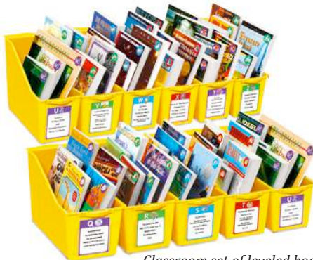
Classroom set of leveled books

We are truly developing life-long readers and writers.