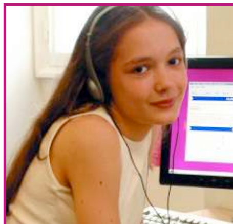
Students can listen as they read difficult reading material through new "digitizing" technology.

Students with learning disabilities that struggle with reading now have greater access to grade level text. By using several technology tools that read digitized text, students can now use the same materials as their peers by hearing the written work as they read it. Some printed resources are already available as recordings, most are not. BRS is using both online access to digital text and using the Kurzweil 3000 system that will scan, digitize, and read any printed material.