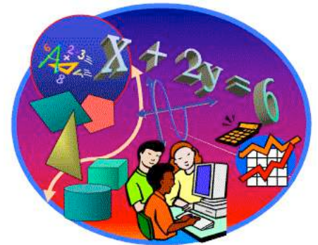
BRS students compete in the national Continental Math League challenge.

Teachers in all intermediate grades created SMART Goals that targeted a weak CMT (Connecticut Mastery Test) area. Students participated in various mini lessons and SMART board activities that focused on these particular goals.