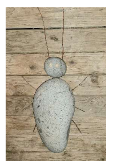
Colby Judson 9/2020