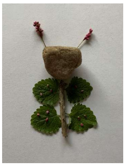
Sophia Ash 9/2020