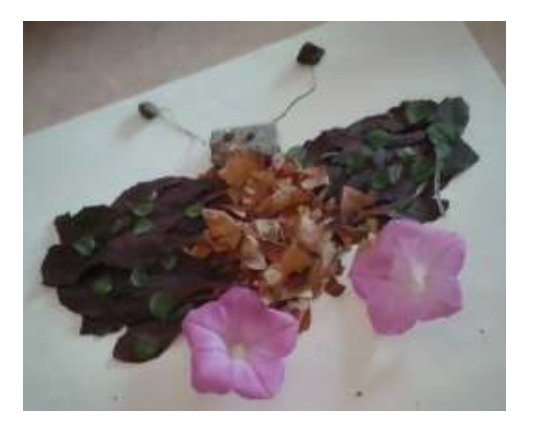
Ember Kober 9/2020