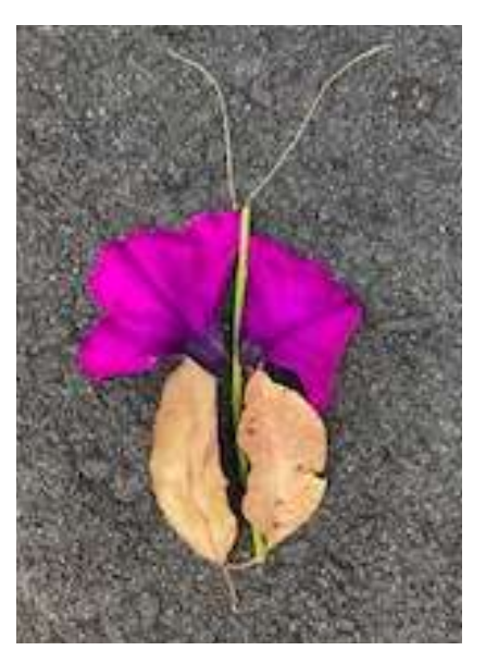
Brady McCann 9/2020