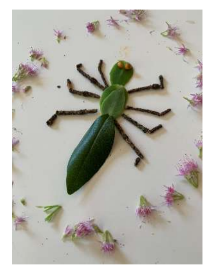
Levi Maloney-Hastillo 9/2020