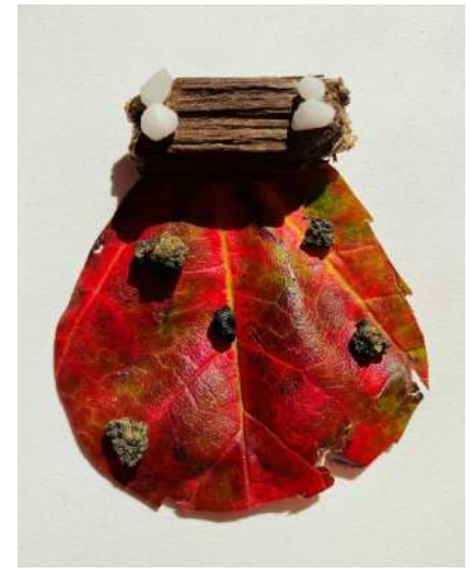
Maya Godi 9/2020