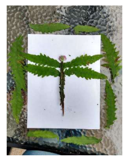
Chad Lincoln 9/2020