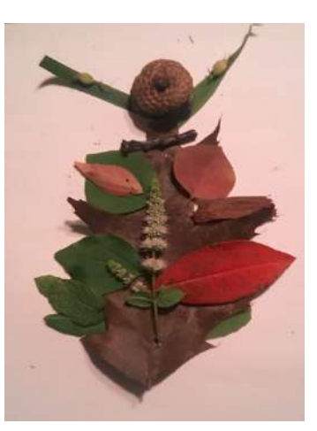
Shaelyn Bojarski 9/2020