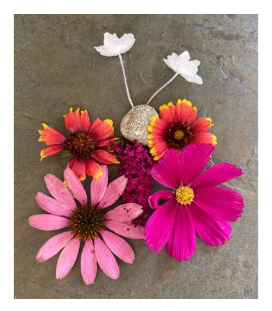
Julia Nowicki 9/2020