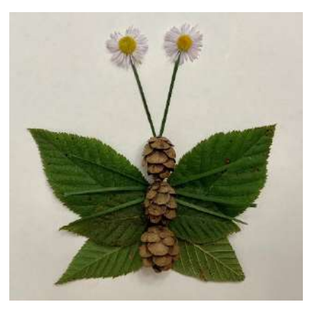
Chrystalla Constantinou 9/2020