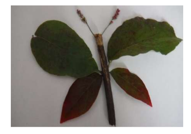
Rebecca Langlais 9/2020