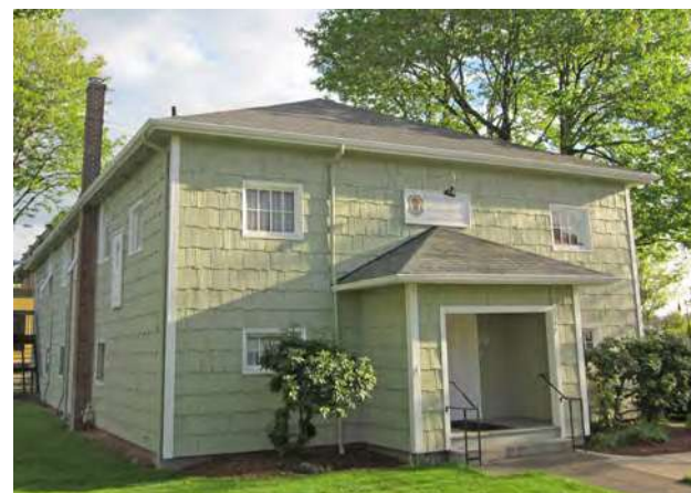
Tualatin's rich history comes alive in its old buildings. The alphabetical dots on the map represent historic buildings along the walk. The photograph to the right is the Winona Grange near the Commons (circa 1940).

The ArtWalk consists of several interconnected trails. Look for the maps like this to determine the route and watch for the colorful trail markers leading the way to an enjoyable adventure discovering Tualatin's art, natural and cultural history.