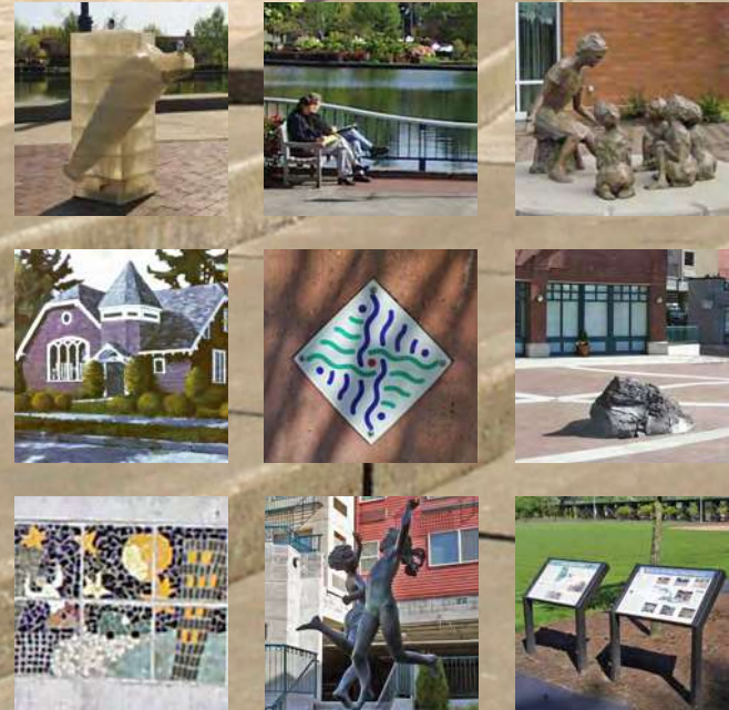
A self-guided tour of Tualatin's art, cultural and natural history