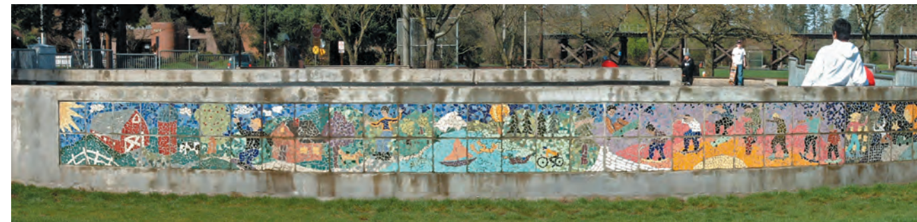
This colorful tile mural depicting Tualatin's history, is located at the entrance to Community Park, along the Park Loop. The mural measures two feet high and thirty feet long.