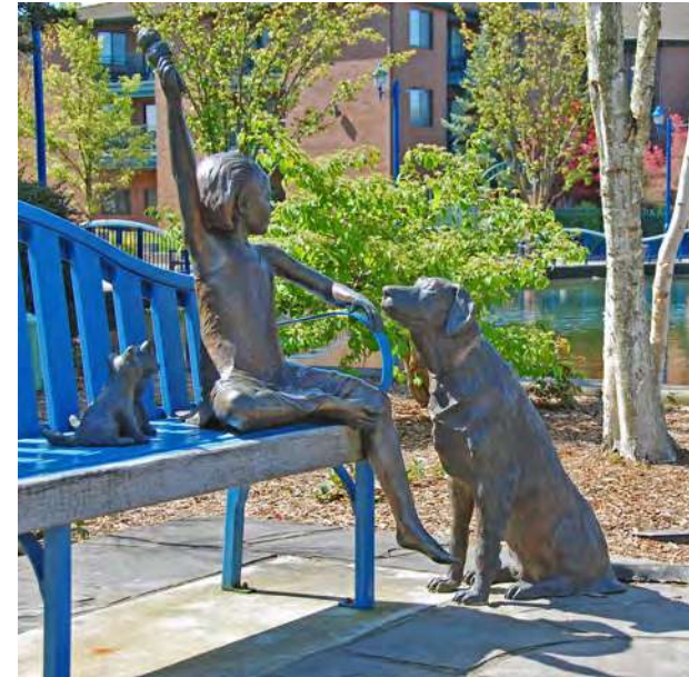
This playful bronze sculpture commemorates the site of an old pet food factory.

The Commons Loop circles the Lake of the Commons. On the route, you will visit an interactive fountain, poetry etched in stone, and whimsical bronze sculptures. Even the glass drinking fountains are works of art!