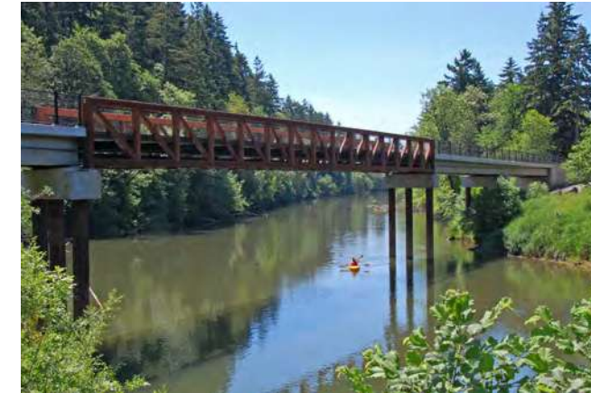
A trail spur at the south end of Community Park leads you to the Ki-a-Kuts Bike and Pedestrian Bridge that crosses the Tualatin River.

The Park Loop is 2.8 miles. On this route, you will pass: Community Park along the Tualatin River, artwork at the Juanita Pohl Center, interpretive panels about Tualatin's history and the flooding of the river, a student-created skate park mural, a spur to the Kia-a-Kuts Bridge over the Tualatin River, artwork at the Police Services building, and a wetland trail with year-round waterfowl.