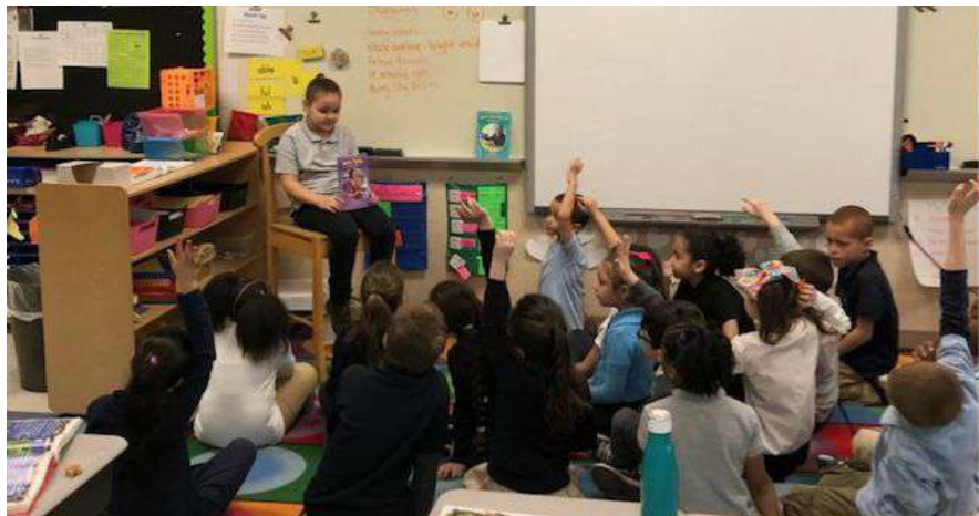
Below is a sample of grade 4 and 5 students doing a lesson integrating drama and language arts.