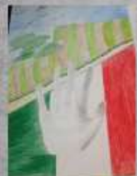
BRENDA DELGADO MORALES