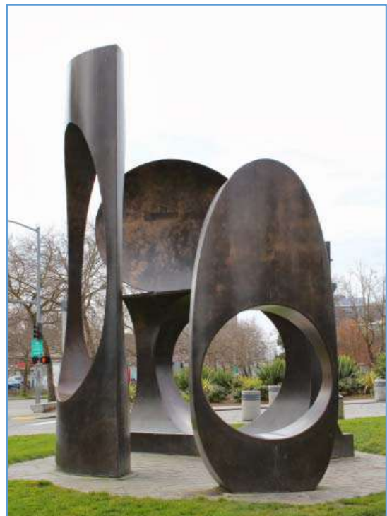
Figure 4: Abstract sculpture in Seattle, WA