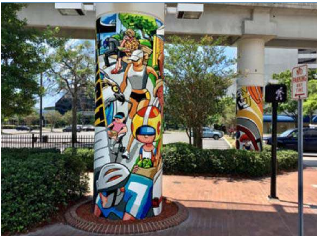
Figure 8: Skyway Columns in Jacksonville, FL

Please visit the City's Department of Planning and Community Development website ( coab.us/26/PlanningCommunity-Development ) for additional information and an application.