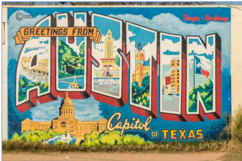
Figure 3: Postcard Mural in Austin, TX

Anyone is welcome to apply for funding including but not limited to property owners, artists, and nonprofits. However, signed property affidavits are required with all applications verifying consent for site specific installation within the designated Façade Improvement Area (Figure 9). Commercial properties with frontage on Mayport Road shall receive preference if funds are limited. Applicants may receive funding for more than one site at a time when projects are located on separate parcels provided that funding is available. A maximum of one grant