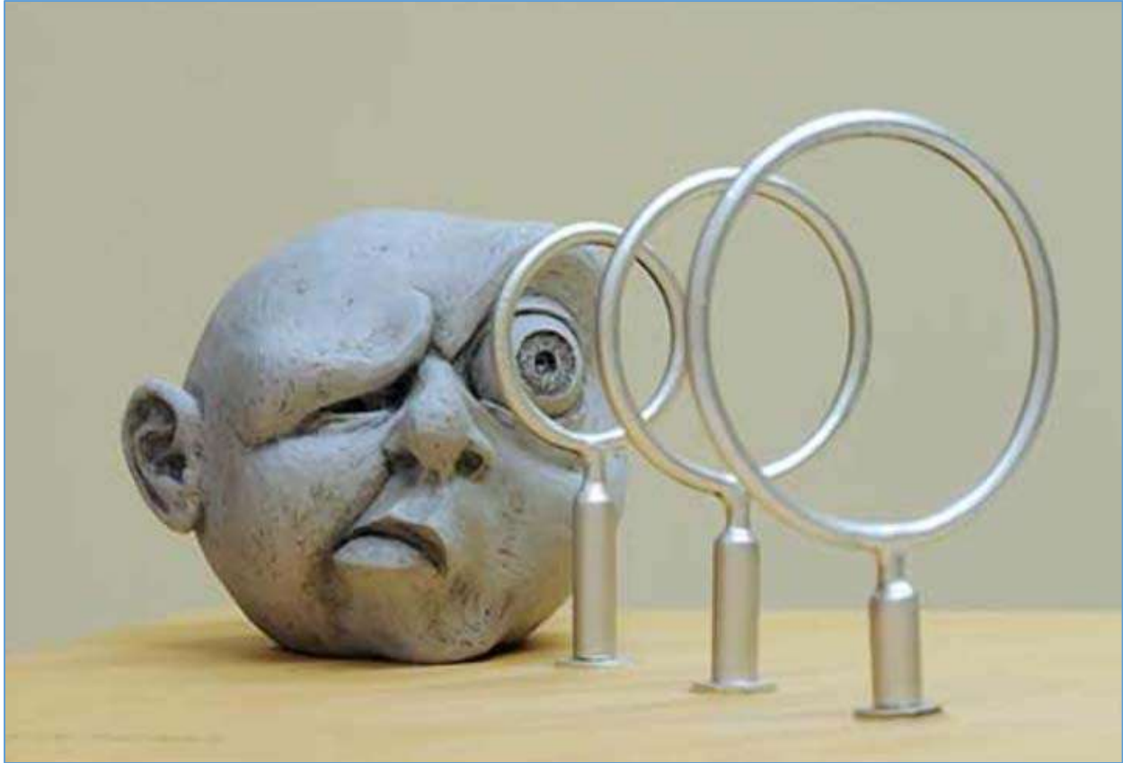
Figure 6: Functional Bike Rack in Fort Wayne, IN

Planning and Community Development staff will review application packages for completion and notify applicants if additional information is needed. Applications will be presented to CURAC for recommendations during their regular quarterly meetings. Applications with recommendations from CURAC will then be presented to the City Commission for consideration within 30 days. Applicants will be notified of approval, denial, or need for additional information within 10 days of the City Commission's consideration.