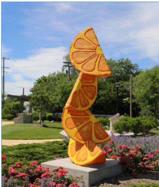
Figure 7: Rotating Sculpture in Olathe, KS

Planning and Community Development staff will review application packages for completion and notify applicants if additional information is needed. Applications will be presented to CURAC for recommendations during their regular quarterly meetings. Applications with recommendations from CURAC will then be presented to the City Commission for consideration within 30 days. Applicants will be notified of approval, denial, or need for additional information within 10 days of the City Commission's consideration.