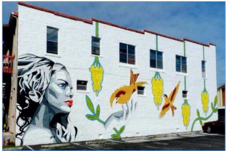
Figure 1: Wall Mural in Melbourne, FL

The Mayport Road Public Art Program is intended to encourage economic development along the Mayport Road Corridor for properties located within the area designated in the Façade Improvement Area (Figure 9). The program provides grant funds to finance quality public art projects that create a sense of place and unique identity along Mayport Road. The program is managed by the Planning and Community Development Department, under the direction of the City Manager.