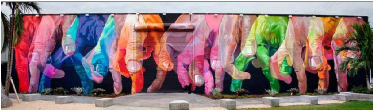
Figure 2: Wall Mural in Miami, FL

The purpose of the Mayport Road Public Art Program is to provide funding for the installation of public art that creates a unique sense of place, strengthens the image of the corridor, increases utilization of existing buildings, enhances economic vitality, and improves property values. Mayport Road is an important commercial corridor in the City of Atlantic Beach and a prime area