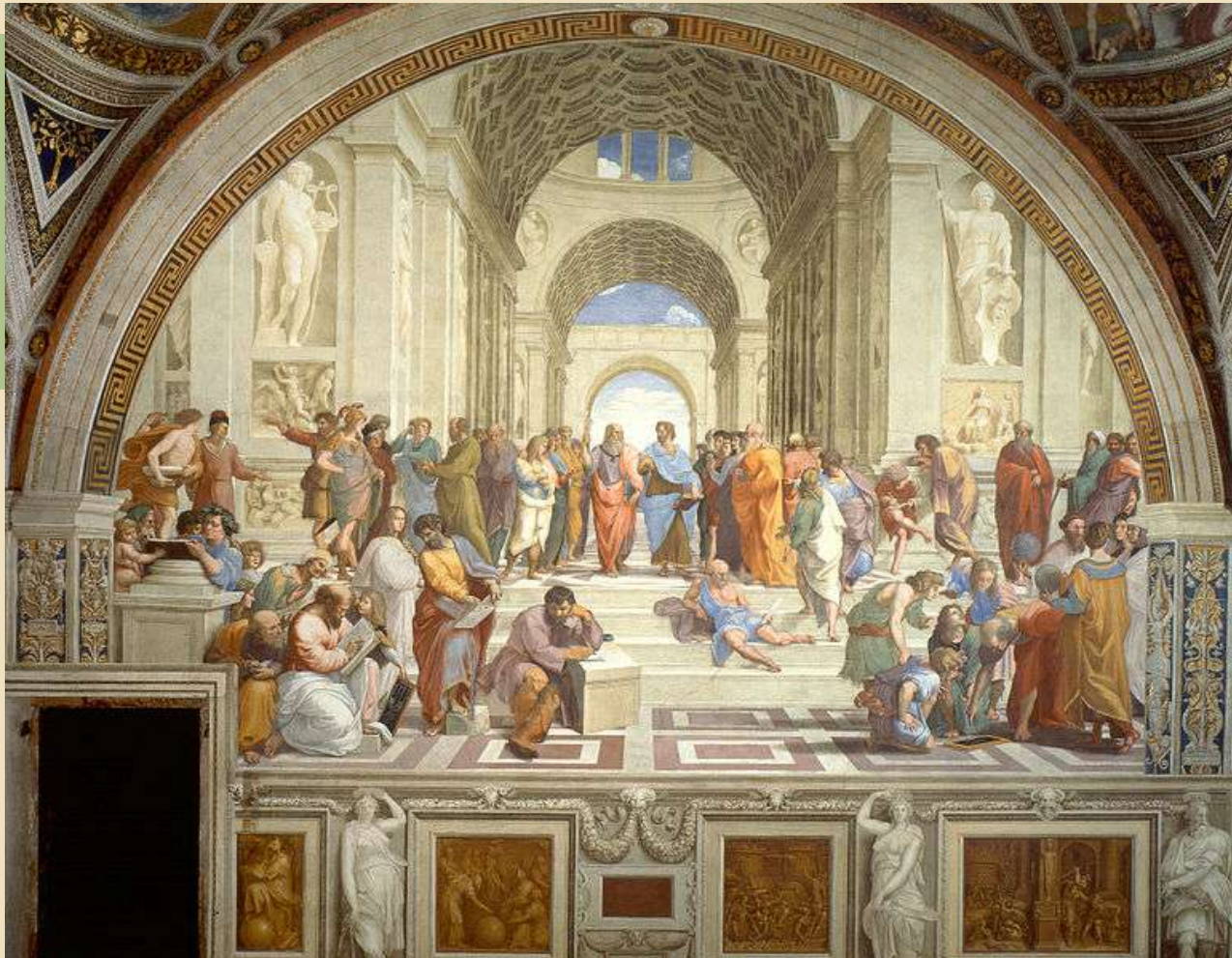
“The School of Athens” By Raphael