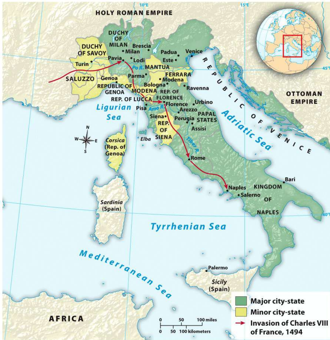
Map 13.1 The Italian City-States, ca. 1494 Chapter 13, A History of Western Society , Tenth Edition Copyright © 2011 by Bedford/St. Martin's Page 377