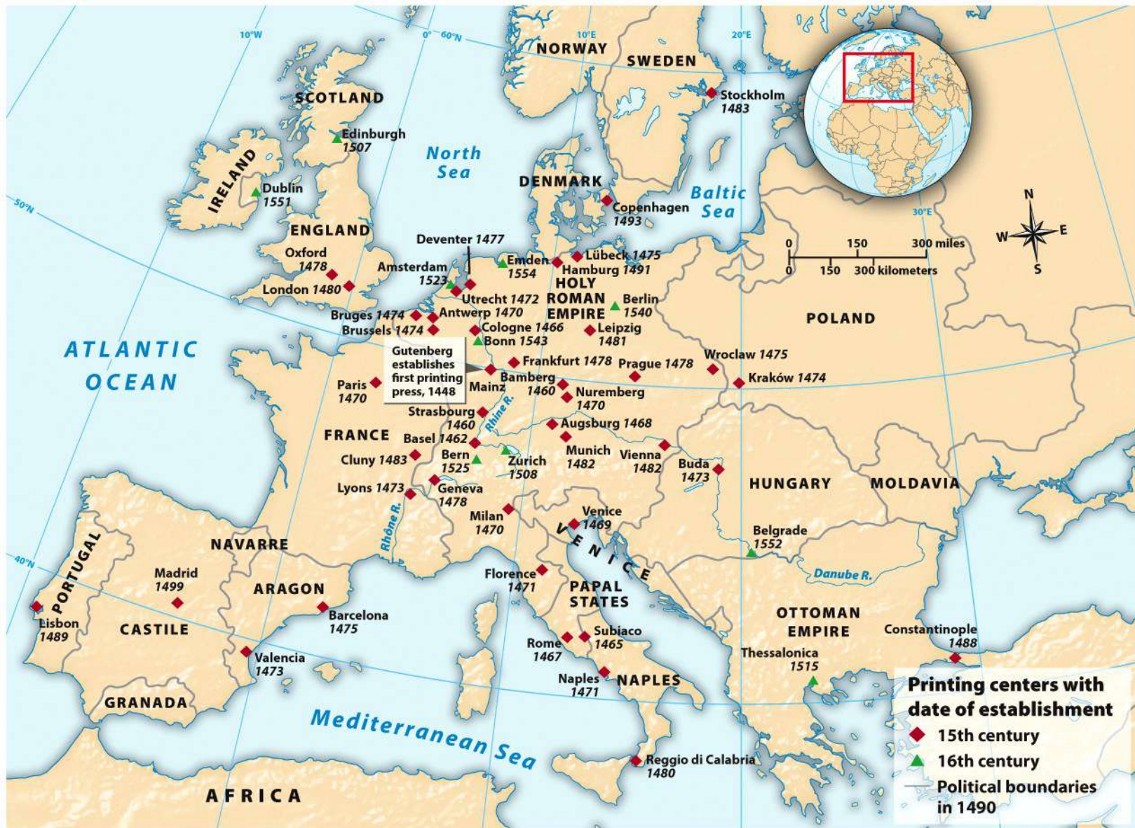
Map 13.2 The Growth of Printing in Europe, 1448-1551 Chapter 13, A History of Western Society, Tenth Edition Page 386