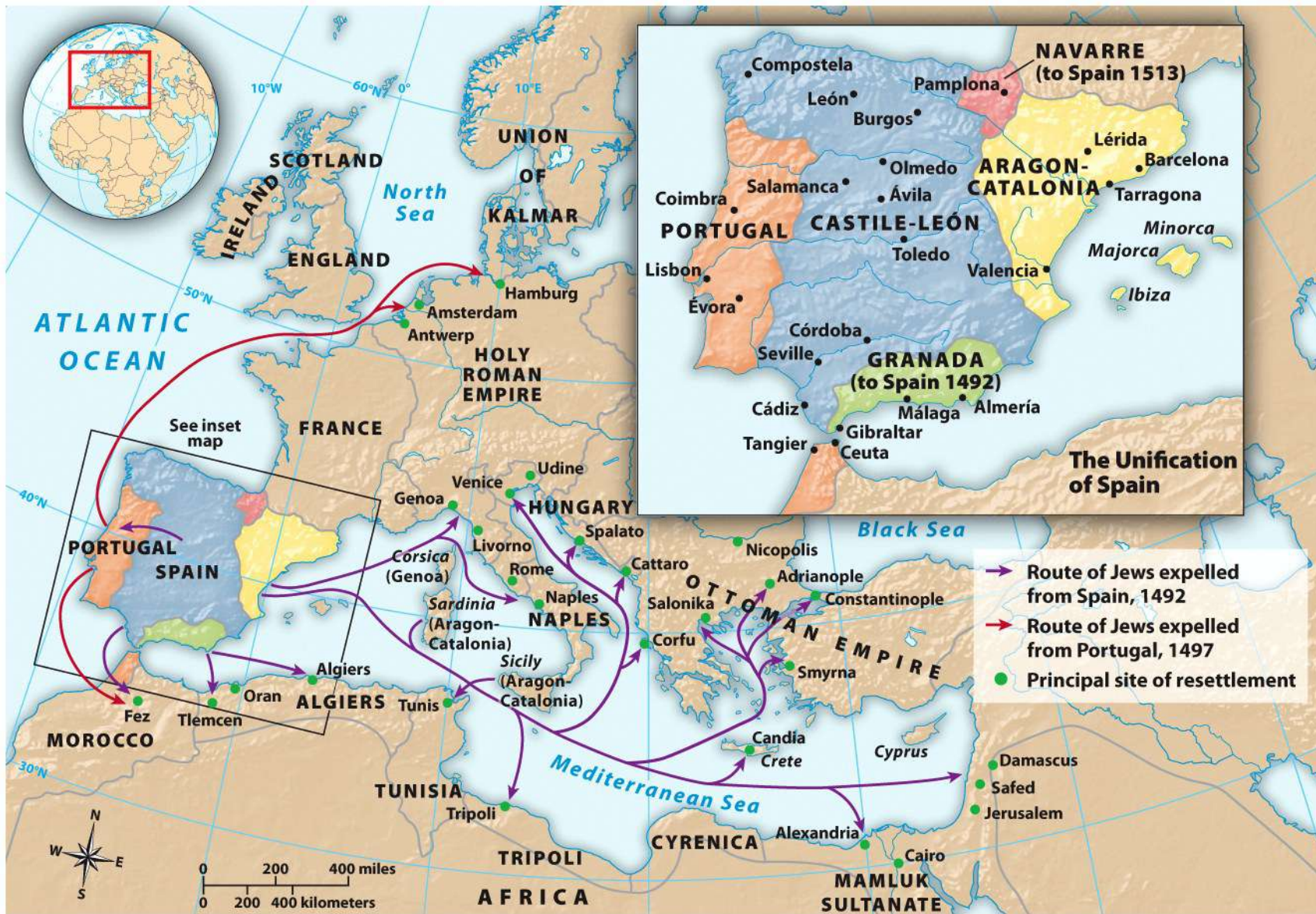
Map 13.3 The Unification of Spain and the Expulsion of the Jews, Fifteenth Century Chapter 13, A History of Western Society , Tenth Edition Copyright © 2011 by Bedford/St. Martin's Page 401