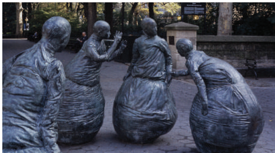
Juan Munoz Conversation Piece New York City Public Art Fund

The Commission for Arts and Culture, through its Public Art Program, should update the Public Art Master Plan every five years.