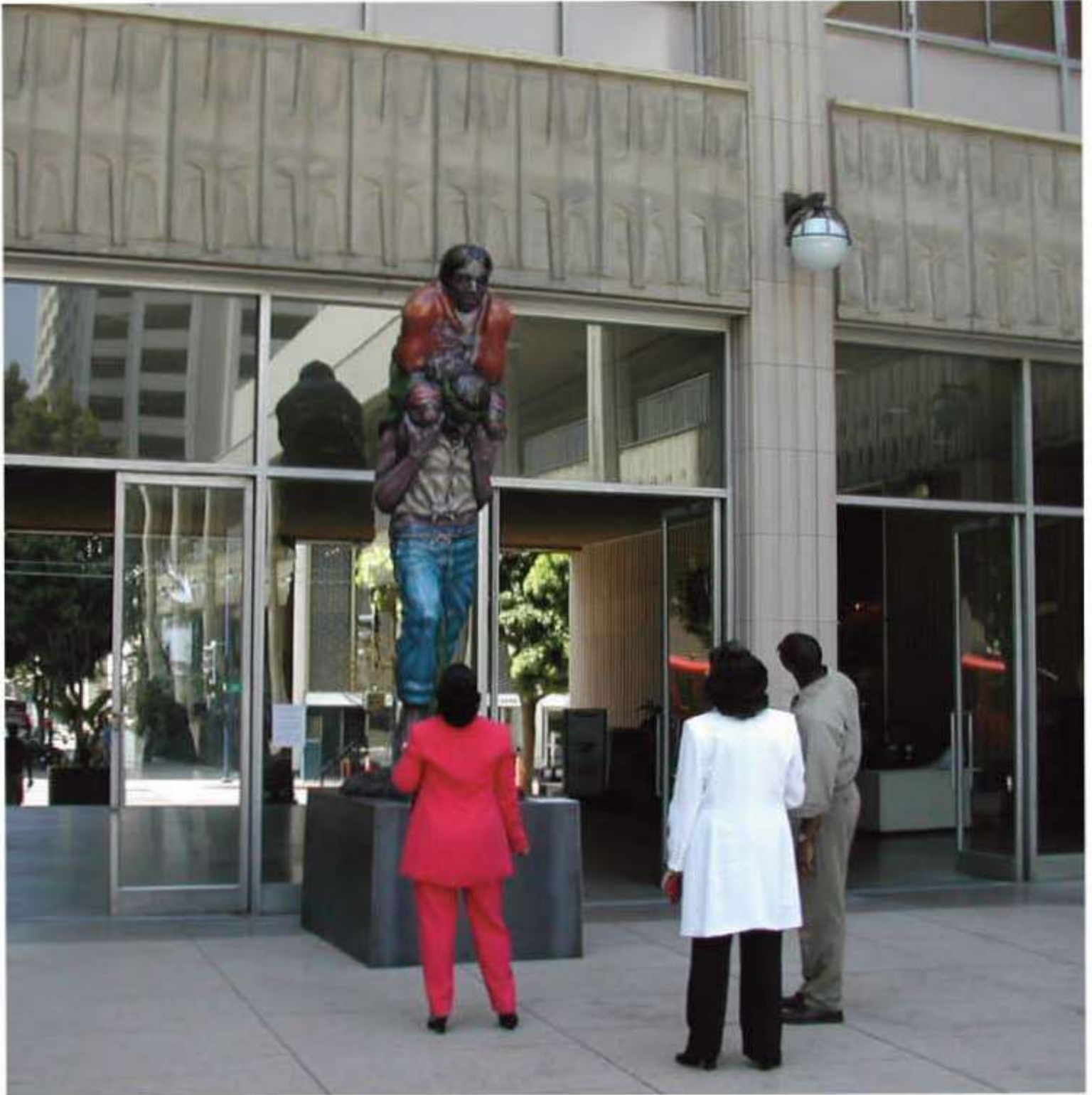
Luis Jimenez Border Crossing City Concourse On loan to the City of San Diego from the San Diego Museum of Art and the Museum of Contemporary Art San Diego