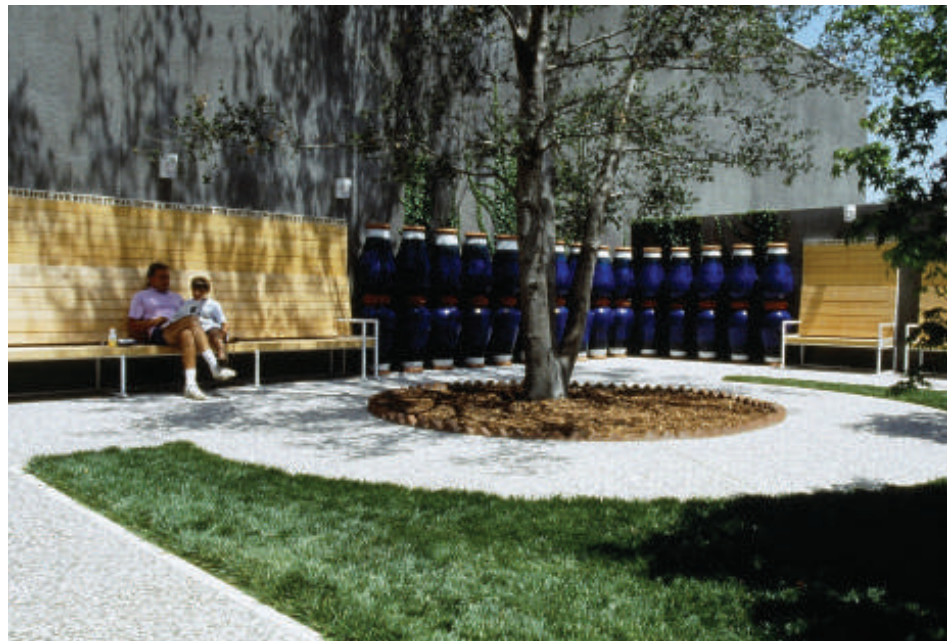
Siah Armajani Poetry Garden Los Angeles

The Commission for Arts and Culture, through its Public Art Program, should emphasize the artistic and visual relationship between San Diego and Tijuana in some public art projects.