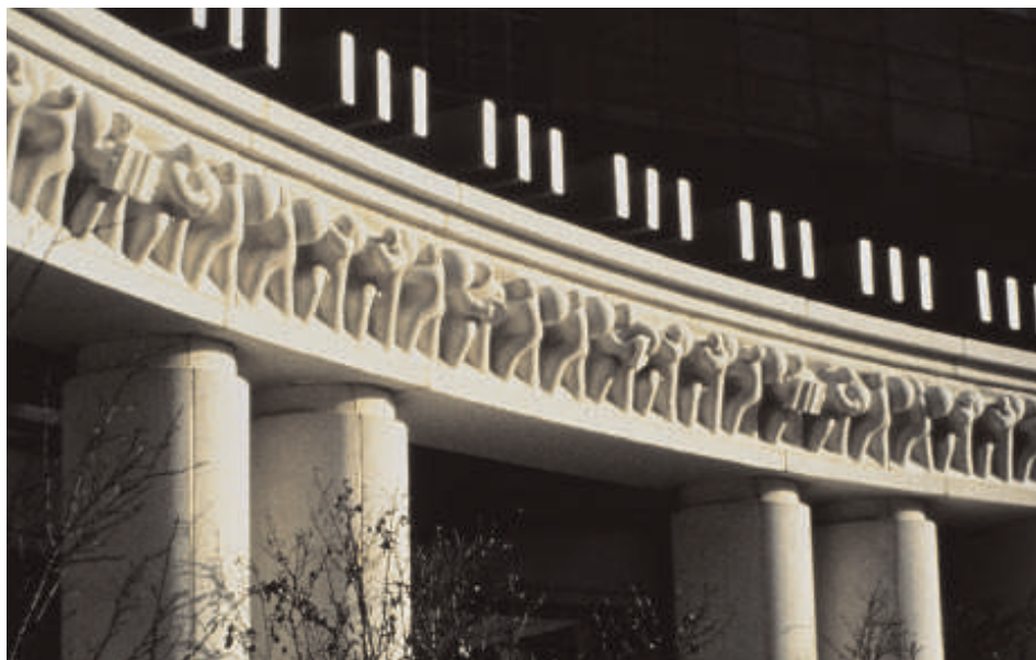
Tom Otterness The New World Los Angeles Federal Court Plaza