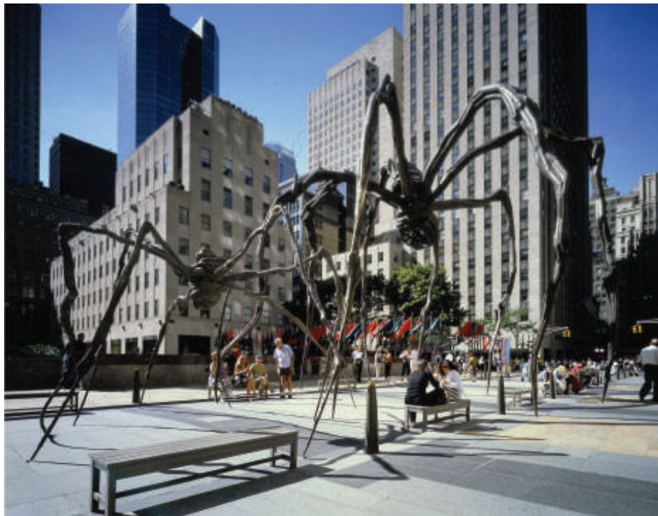
Louise Bourgeois Spiders New York City

Privately donated artworks should require a maintenance endowment to ensure for the long-term care of the artwork.