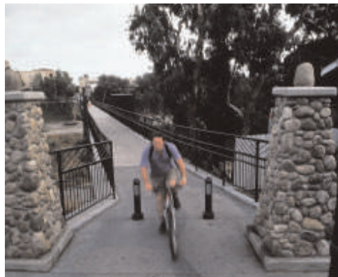
Stone Paper Scissors Vermont Street Bridge Hillcrest