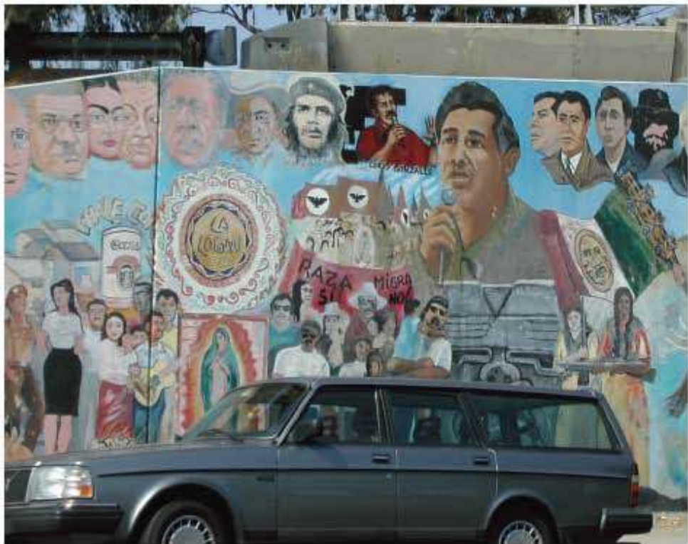
Chicano Park Barrio Logan