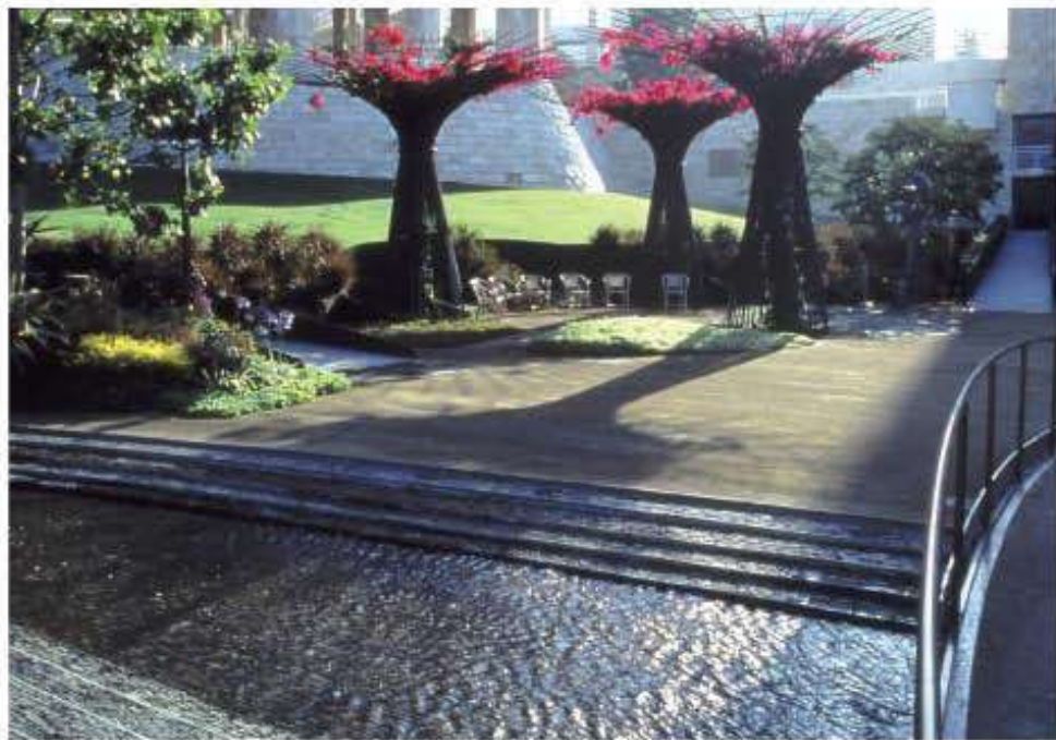
Robert Irwin Central Garden Getty Center, Los Angeles