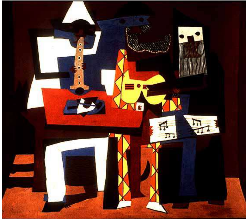
Pablo Picasso Three Musicians