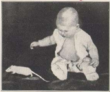
He sees a white rat