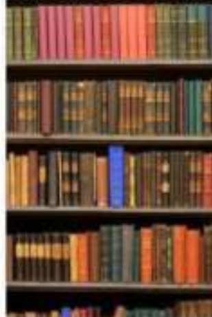
90 th percentile