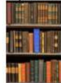
50 th percentile