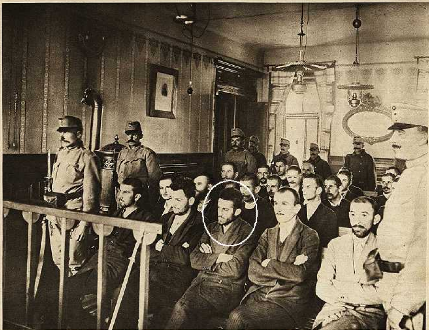
Erste Reihe von links nach rechts: Trifko Grabez (20 Jahre schweren Kerker), Nedjelko Gabrinovic (20 Jahre schweren Kerker), Gavrilo Princip, der Mörder des Thronfolgerpaares (20 Jahre schweren Kerker), Danilo Ilic (Tod durch den Strang), Miroslav Jovanovic (Tod durch den Strang). Die rachsüchtigen Handlanger des Belgrader Komplotts und Anstifter des Weltkrieges erwarten auf der Anklagebank den Urteilspruch des Gerichtes von Sarajevo.