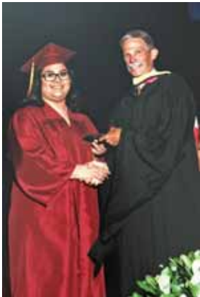
Adult Diploma Classes Winter 2019 W, Th 1/8-3/12 6-9pm No Fee

All high school diploma classes are approved by the CA Department of Education, and courses meet the graduation requirements of the Acalanes Union High School District. To determine what previous academic work counts toward the required units and to make a plan to complete work to receive a diploma, the student must call for an appointment. The student must obtain transcripts of all work done prior to making an appointment. The student may receive credit for previous high school work, military service and work experience.