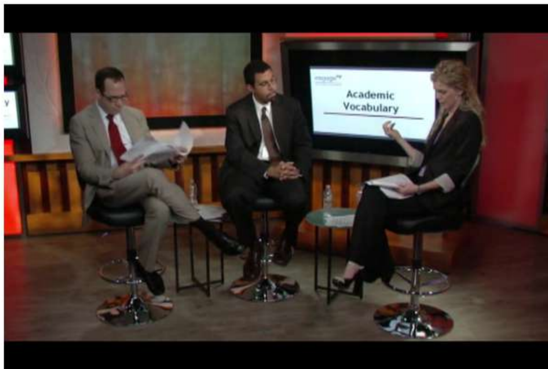
SHIFT 6: Academic Vocabulary from EngageNY on Vimeo .

http://engageny.org/resource/common-core-in-ela-literacy-shift-6-academic-vocabulary/