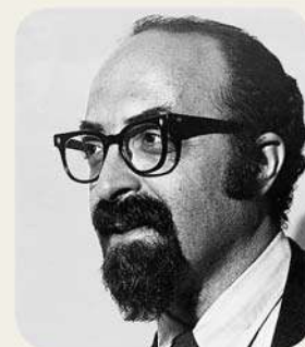
Chaim Potok 1929–2002

While growing up in New York City, Chaim Potok lived the strict life of a Hasidic Jew. His parents wanted him to be a religious scholar. But by the time he was 16, Potok had started reading