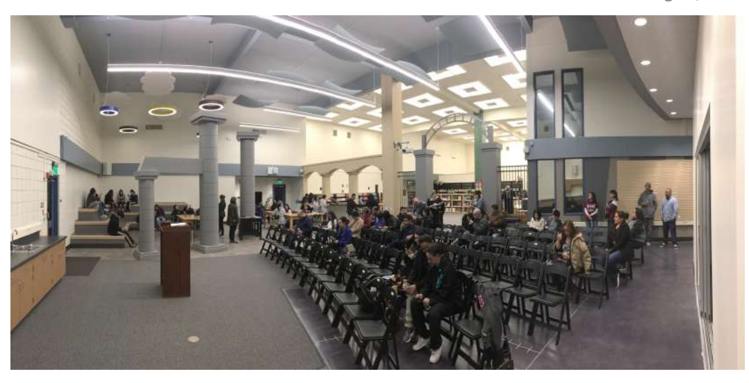
Above: A look inside our new Flexible Instructional Space & Library, just one of the areas on our campus that has been updated and upgraded with Measure L Bond funds.

For more information, please call the School Office (include your school number) ** Información en español al 923-1902 ** Thông tin tiếng Việt gọi số 923-1903 ** 如果您需要講中文的服務, 請致電 (408) 923-1901