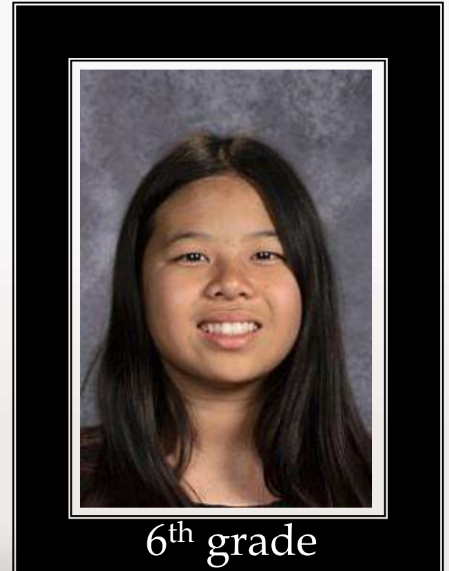
6 th grade