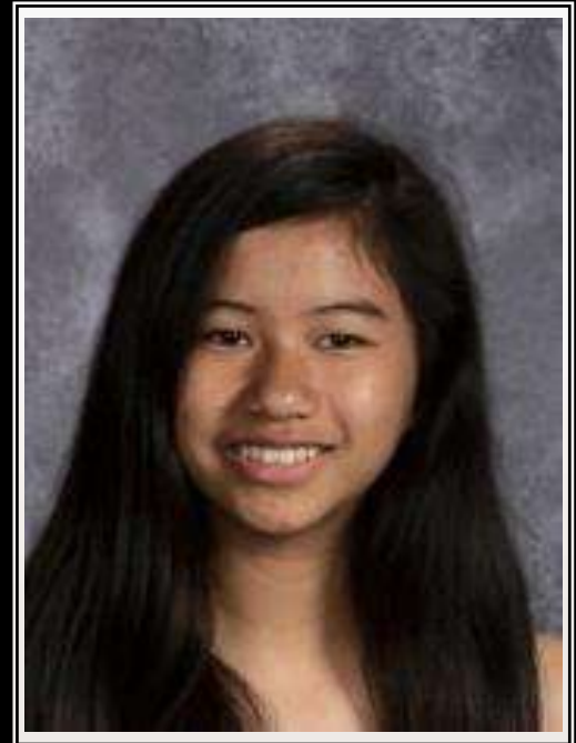
8 th grade