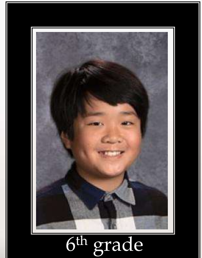
6 th grade