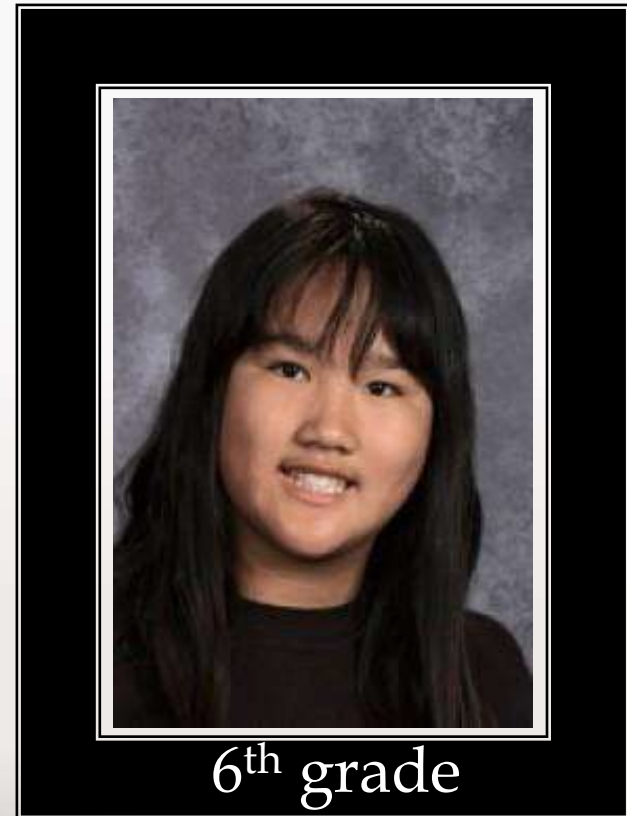
6 th grade