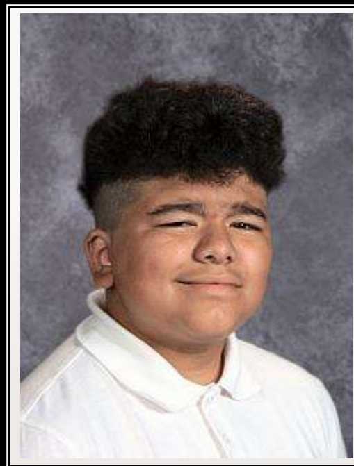
6 th grade