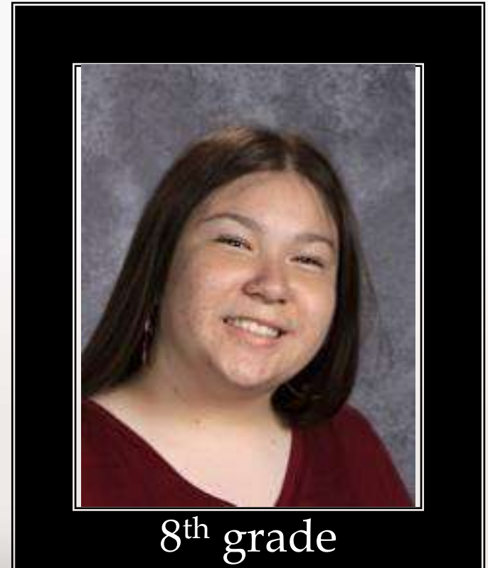
8 th grade