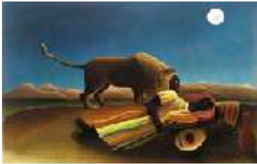
The Sleeping Gypsy Henri Rousseau - French 1897 Oil on canvas 51 x 79 inches