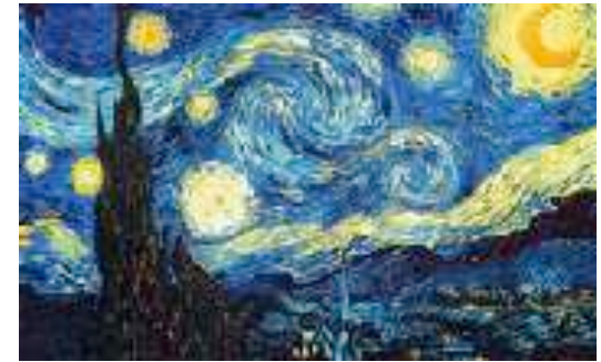
The Starry Night Vincent Van Gogh – Dutch 1889 Oil on canvas 29 x 36 ¼ inches