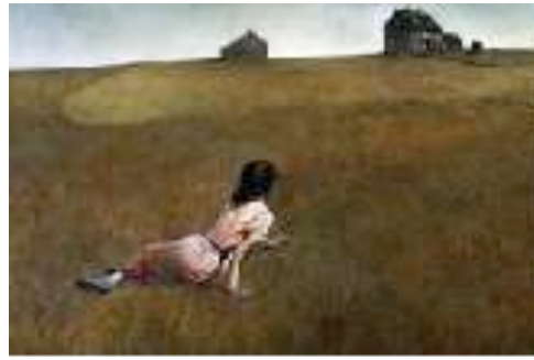
Christina's World Andrew Wyeth – American 1948 Tempera on panel 32 ¼ x 47 ¾ inches