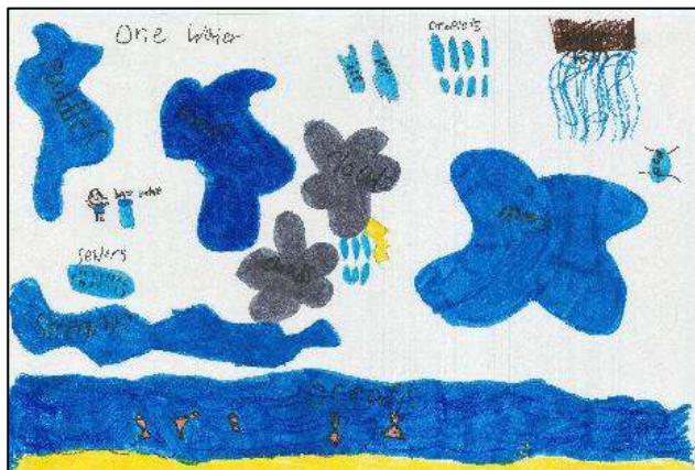
Honorable Mention: Kensley Russell Brookwood Elementary