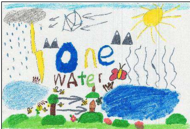
Second Place: Owen Xiong Brookwood Elementary