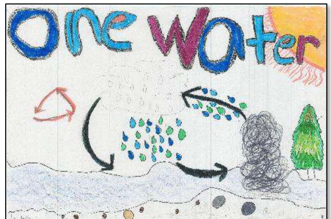
Honorable Mention: Nora Bowgren Brookwood Elementary