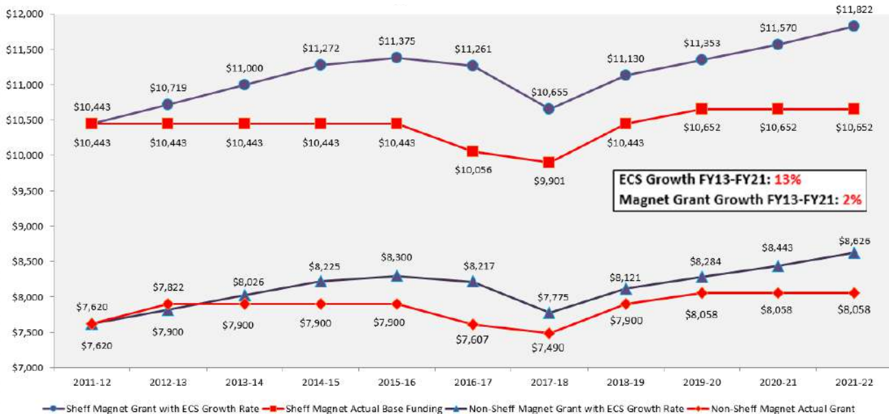
Actual Magnet School Per Student Grants (Sheff & Non-Sheff) vs. Funding based on Per Student ECS Growth Rate