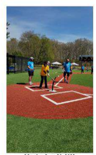
Monday June 20, 2022 10:00 a.m. Shotgun (Registration 9:00 a.m.)

Miracle Field is a custom-designed field with a cushioned turf to help prevent injuries, wheelchairaccessible dugouts and a completely flat, barrier-free surface to provide accessibility for visually impaired players or players in wheelchairs