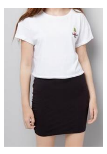
Short sleeved T-shirt