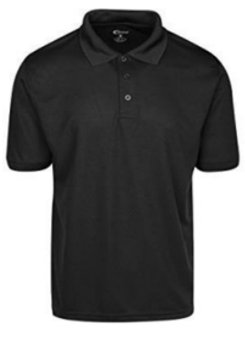
This is a POLO shirt. Not long-sleeved.