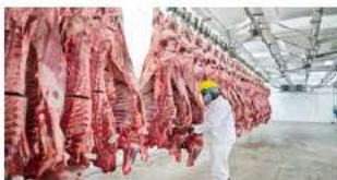
Processing & Packing (fruit, vegetables, chicken, eggs, pork, beef, lamb or other livestock)

For more information, call (970) 683-8686