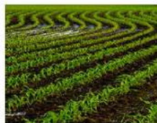
Agriculture or Field Work (planting, picking, sorting crops, soil preparation, irrigation, fumigation)