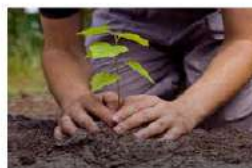
Forestry (soil preparation, planting, growing, cutting trees)