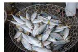
Fishing & Fish Processing (catching, sorting, packing, transporting fish)