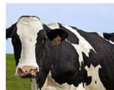
Dairy & Cattle Raising (feeding, milking, rounding up)