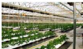
Nursery or Greenhouse (planting, potting, pruning, watering, harvesting)