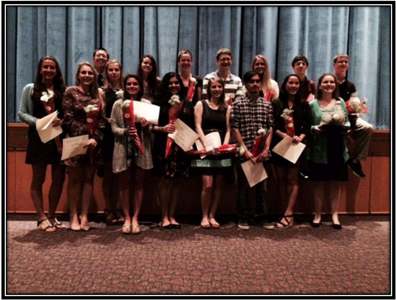
Tolland High School's Class of 2015 Top Twenty Scholars