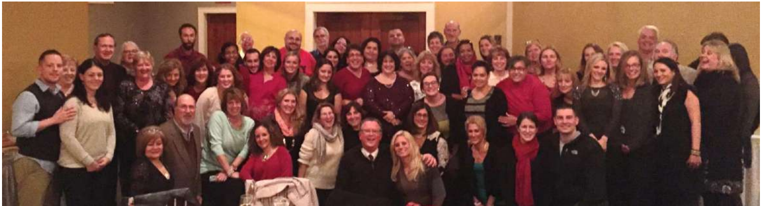
80 Gathered for Carrington Holiday Celebration Yesterday Last evening many members of the greater Carrington family came together – past and present faculty and staff as well as family members.