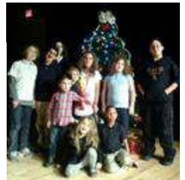
(right) Some members of the Family Read-Together Book Club