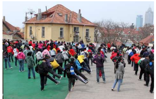
Children at QEPS start days with morning exercises.

No Obligation If you are interested, come to the meeting. There is no obligation, only information.