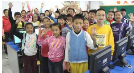
Children of Qingdao send greetings to Carrington students.

Notice: Any parent or legal guardian of a Waterbury Public School student may exempt his/her child from any or all lessons dealing with Human Growth, Development and Family Life portions of the Health and Wellness Education Curriculum. This may be done by written notification to the Principal of the building that the child attends. Copies of the curriculum are available at the school for parent review. If you would like to read the curriculum, please call the school and make an appointment to go in and review the material.