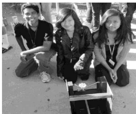
Engineering 1 students design tennis-ball catapults that can hit a target 50 feet away

Courses - SEA students take special Science & English courses that develop their critical thinking, problem-solving, communication, and teamwork skills. SEA English courses include literature with science and engineering themes. Engineering 1 and 2 teach core science principles and apply them to engineering projects. Engineering 3 and 4 teach the design process and students use 3D design software to design bridges, rockets, robots, toys, and smart devices.