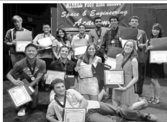
SEA students earn a special diploma and medallion at graduation if they complete all Academy Graduate requirements

Community - SEA students are part of a small learning community. They are with students and teachers who share their interests, giving them a supportive and personalized high school experience. SEA students are also part of West High, so they can participate in all West High sports, clubs, and other activities.