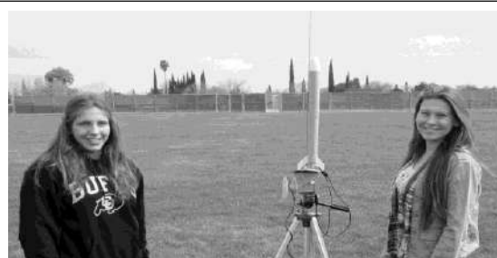
Engineering 3 students design rockets to carry payloads such as eggs and altimeters to the highest altitude & return safely

Activities - SEA students can select from a variety of activities each year. They may go to places such as Lawrence Livermore Labs, the Stanford Linear Accelerator, the Patriots Jet Team Foundation, or EA Games. Engineering students may go to Great America to study the physics of amusement rides. Some students join the Robotics Club where they design, build, program, and operate robots that they enter in regional and state tournaments.