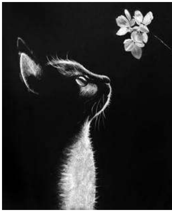
by Audrey Vu